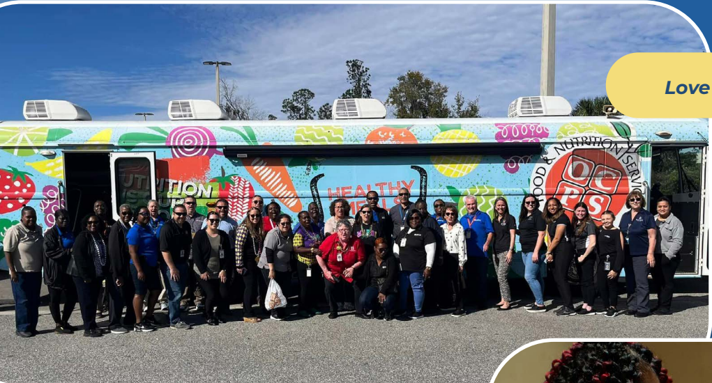
Love the Bus