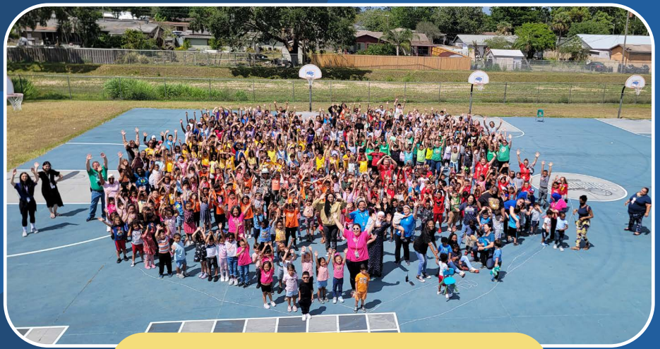
Three Points Elementary Get Active Autism Acceptance Walk